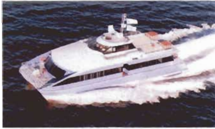
M/V Condor Express

The intensive trials would provide the first data set of this scale and level of detail for a passenger-only fast ferry vessel in the Puget Sound