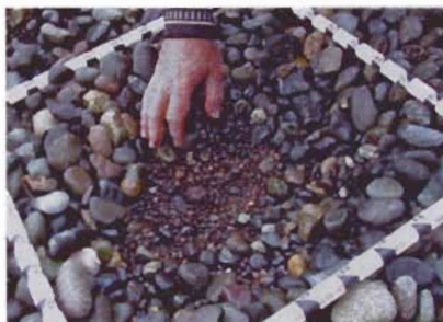
Sediment size distributions have been determined from photographs using quantitative image analysis techniques.

Collection of baseline environmental data has been underway and will continue throughout the study. Beach surveys are being conducted on a quarterly basis. Beach profiles have been surveyed and sediments characterized in terms of size and stratification in August 2004 and November 2004, building on the