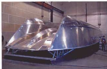
A state-of-the-art foil-supported catamaran designed by Teknicraft

The availability of the experimental vessel for trials between January and May 2005 is a significant opportunity